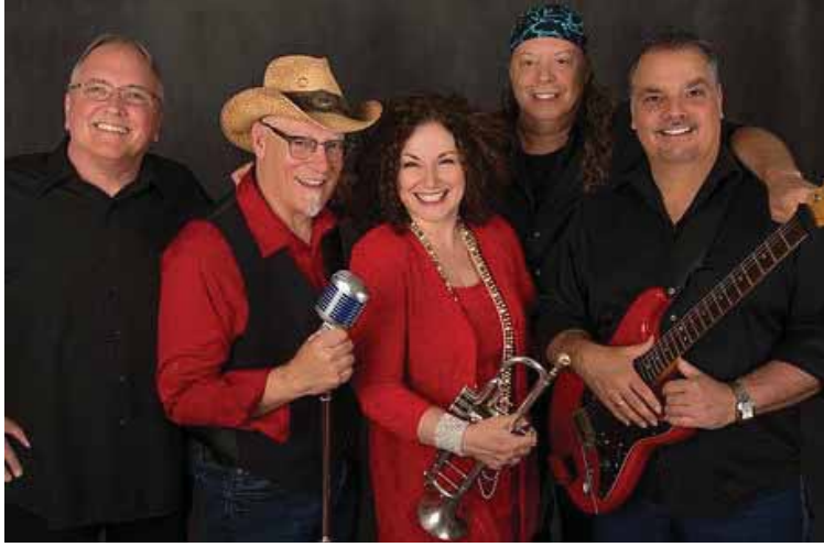
dr D band, Premier Funk, R&B and Rock